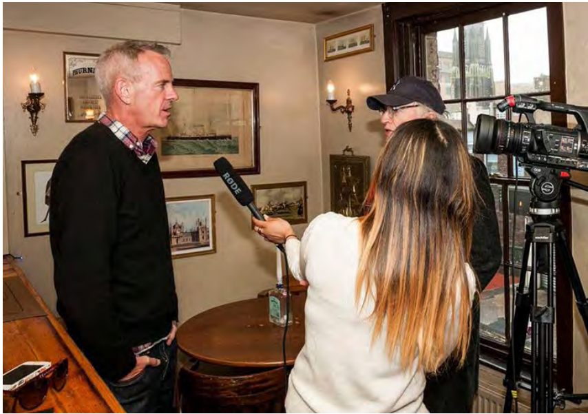
Norman Cook (Fat Boy Slim) interviewed for Latest TV after visiting the Hippodrome with the CIC. He was also interviewed on BBC and ITV news programmes and spoke enthusiastically about the magnificence of the building and its potential for restoration

Hippodrome talking heads have appeared at each stage of the campaign across all local media channels